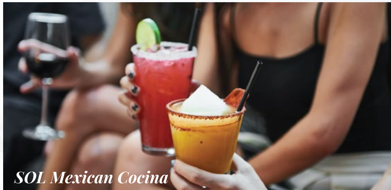
SOL Mexican Cocina

From early morning bites and caffeine, to unique client lunch experiences unavailable elsewhere, to rejuvenating cocktails and snacks connecting you with associates, to dinner celebrating a special event with your loved ones.