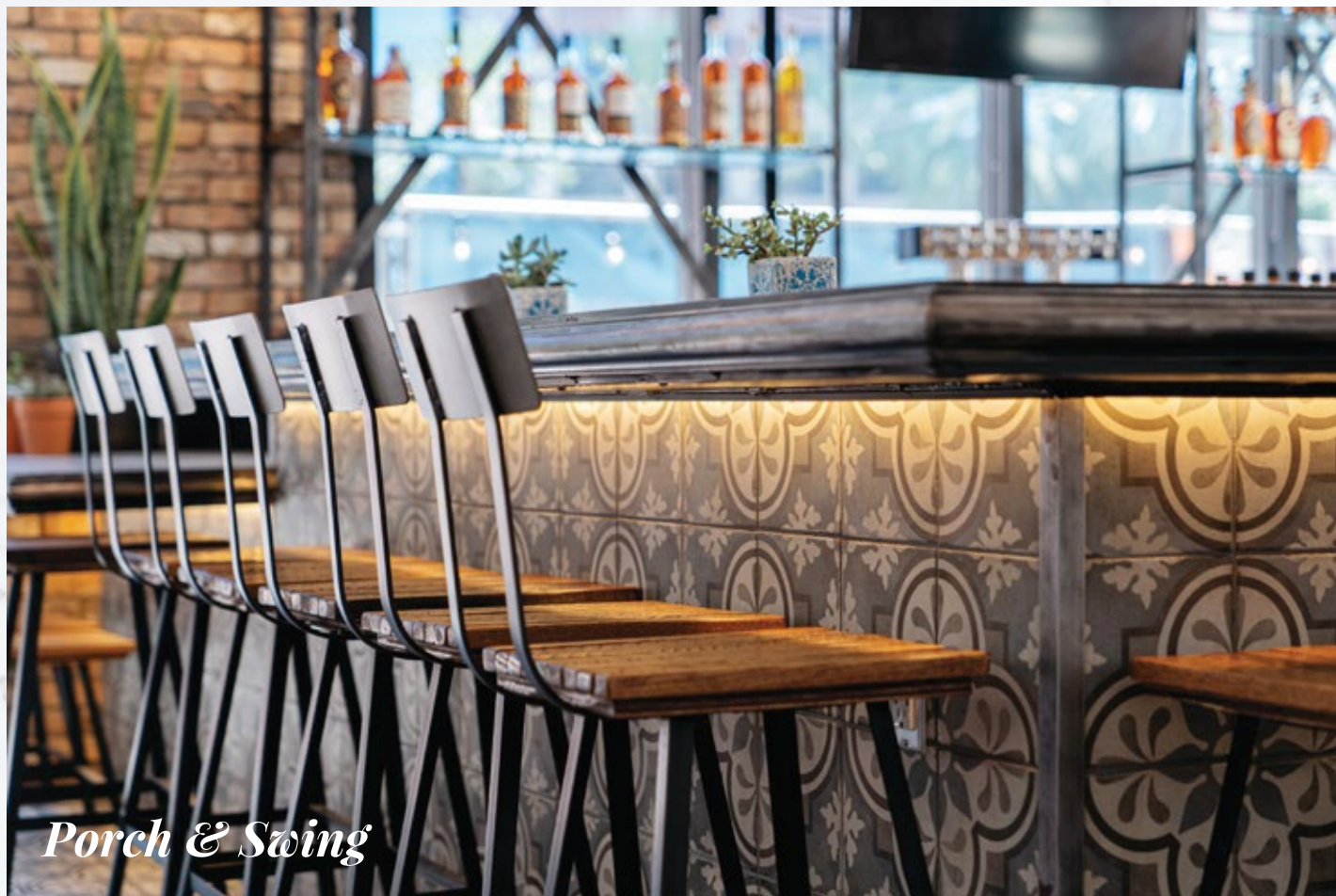
Porch & Swing

Our on-site dining options add convenience but equally, they add a buzz and infectious energy to the property. At Centerview, the workday can seamlessly blend from early morning bites and caffination into a productive working lunch, or a laid back happy hour amongst co-workers.