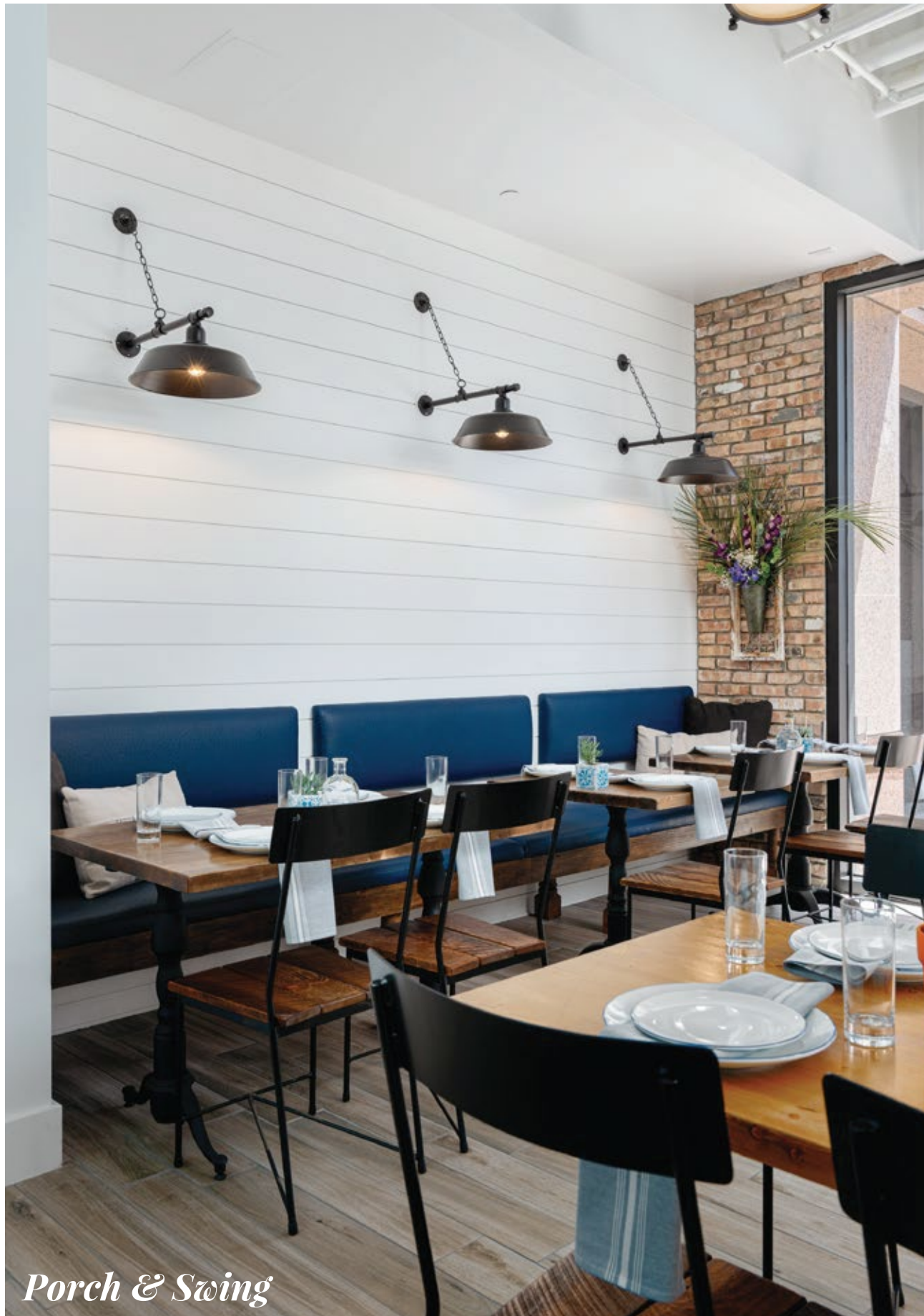
Porch & Swing