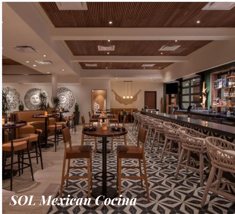
SOL Mexican Cocina

Our on-site dining options add convenience but equally, they add a buzz and infectious energy to the property. At Centerview, the workday can seamlessly blend from early morning bites and caffination into a productive working lunch, or a laid back happy hour amongst co-workers.